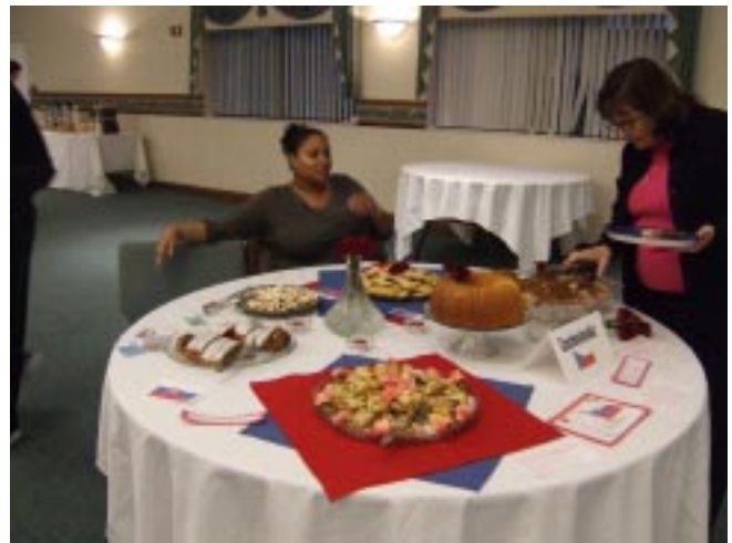
Tables were attractively decorated with a theme from the dessert's country of origin. On the left is "Ireland" and on the right is the Czechoslovakian dessert table.